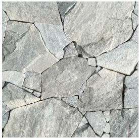
03: STONE FEATURE