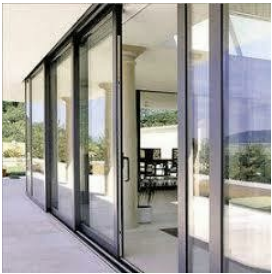
04: ALUMINIUM WINDOWS & DOORS